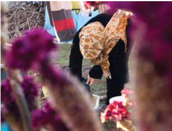
My Mother. Every time I look at her while she is hanging the laundry, I realize that she is washing my soul with the water of tenderness.