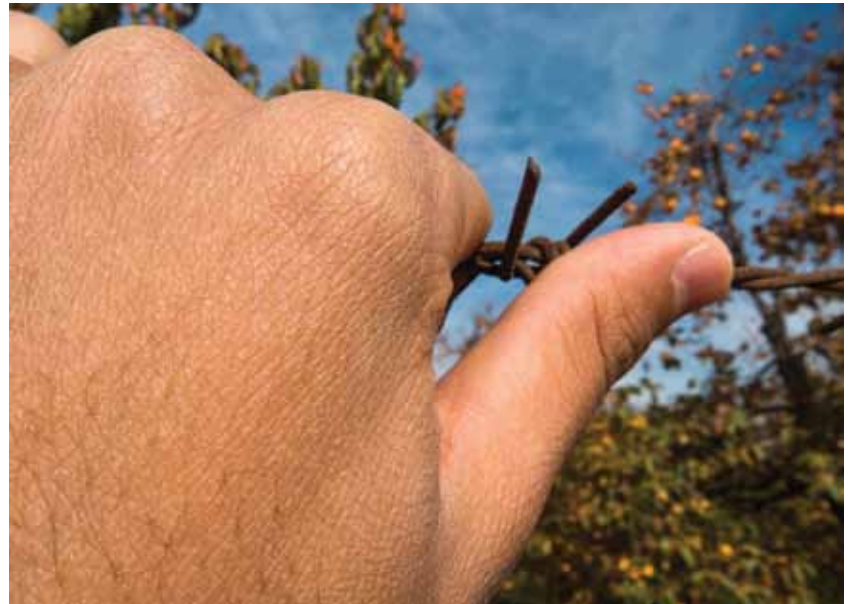
Pain... Missing...Distance...Adoration...Beauty... Tents...Cold... Hunger...Identity...A Student...An Actor...A Dancer...A Photographer...A City...A Country...A Question...An Exit...No Answer...Hope...A Future...Loss...A Writer...Being away from home...Society...Routine...Return...And a right...Do you hear what my hand is screaming?