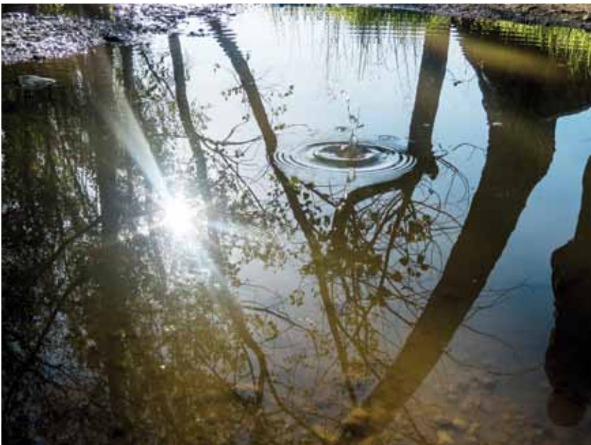
A Meeting. I was very proud when I captured this shot: The moment the stone met the water. Nature's reflection is impressive (amazing timing), said Brendan...